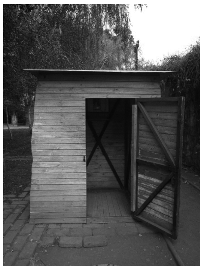
FIGURE 3 – CELL FOR PRISONERS AT VILLA GRIMALDI