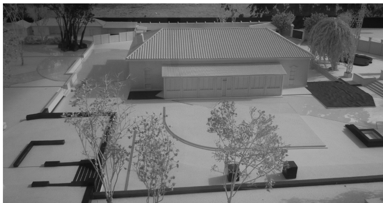
FIGURE 1 – REPLICA OF VILLA GRIMALDI