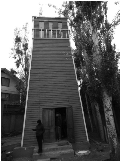
FIGURE 4 – THE TOWER AT VILLA GRIMALDI