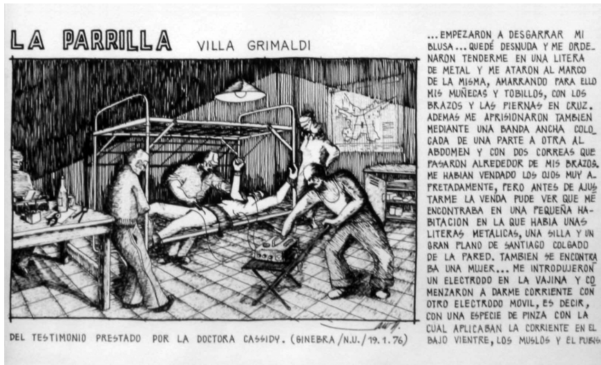
FIGURE 2 – THE GRILL

Drawn by prisoner Miguel Lawner (1976).